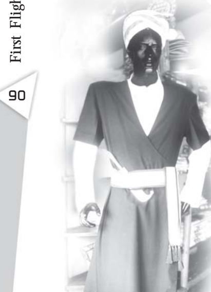
Traditional Coorgi dress